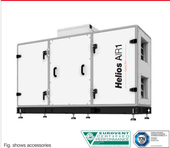
Fig. shows accessories