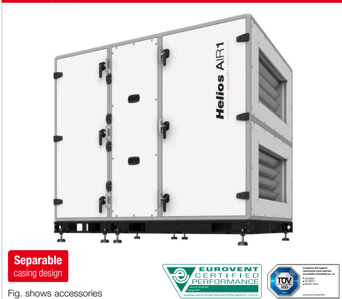
Fig. shows accessories