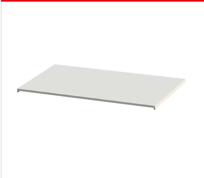
AIR1-AAD KR KW + DX XHP