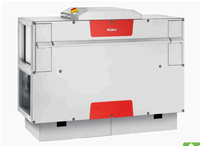
KWL EC 800 S with base cover (accessories)