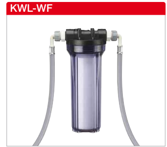
Replacement water filter (for all types)