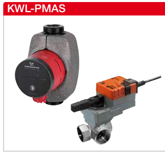
Pump-mixer connection set (for KWL HBX.. WW)