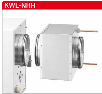
Low-temperature heating element (for KWL HBX.. WW)