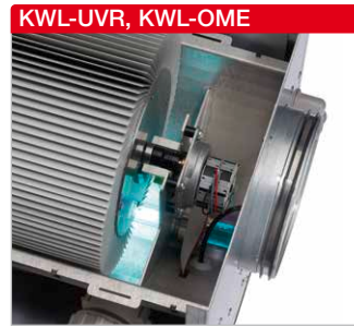
Replacement UVC ducts and osmosis membrane (for all types)