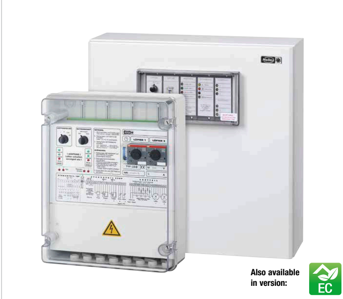
Also available in version: